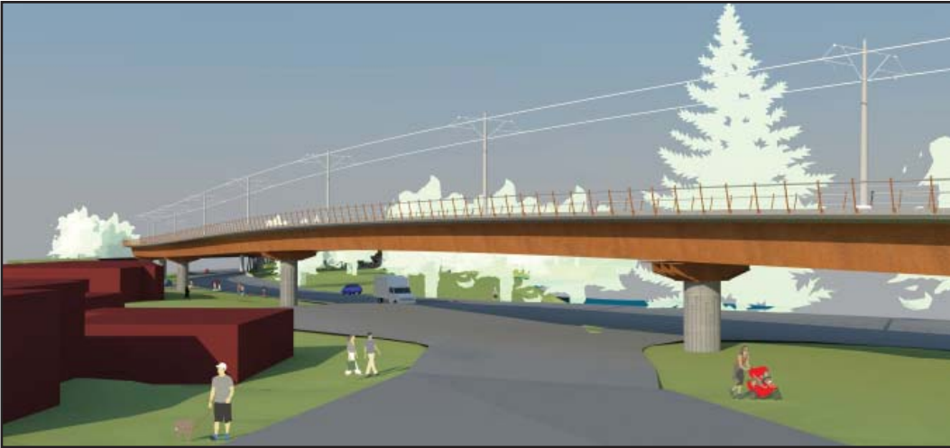
This illustration of the Kellogg Creek bridge, looking northeast, shows the thin profile of the structure over River Road.

granite streambed routes stormwater into the landscaped water treatment area on Lake Road. The artist has also proposed carved granite shelter columns.